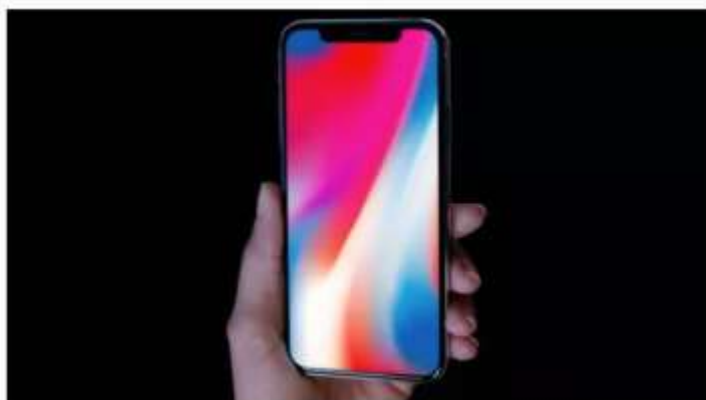
The new iPhone X—pronounced "ten"—features an edge-to-edge OLED display.

The latest and greatest iPhone, with a larger screen (5.8 inches) made from OLED glass, (Apple calls it "Super Retina") which is sharper, and higher definition than other iPhones and an edge to edge body that eliminates the bezels.