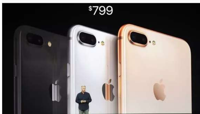
Phil Schiller, Apple's senior vice president of worldwide marketing talks about pricing for the new iPhone 8 Plus.

The Plus model also has another improved camera, and a cool new software feature called "Portrait Lighting," that adjusts the image accordingly in low light, and pulls in some fun software tricks like the ability to eliminate, say, the background of a photo. Both models come with expanded starter storage, at 64 GBs.