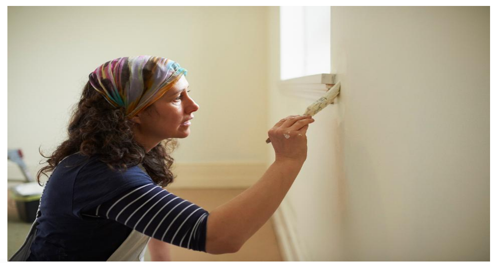
Embracing Home Renovations When You're Resistant To Change