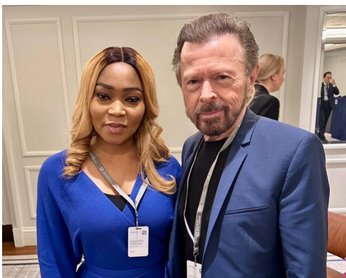
With Björn Ulvaeus of the iconic music group, ABBA

accountability. Part of her role as the acting Managing Director and CEO of the agency is to use cutting edge technology and virtual channels to make Edo State the preferred tourism destination in West Africa for both local and international tourists by highlighting the state's unique culture, history and pleasant people.