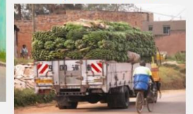
13,500 of 3MT Trucks