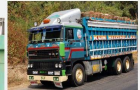
5,060 of 8MT Trucks