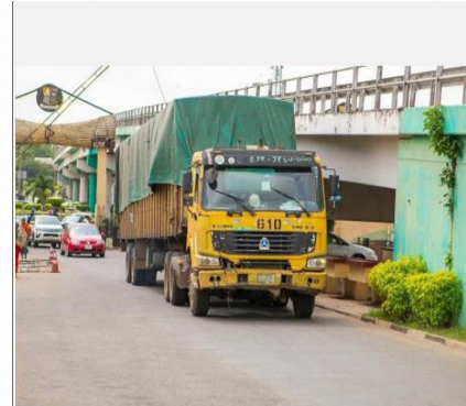
1,600 of 25MT Trucks